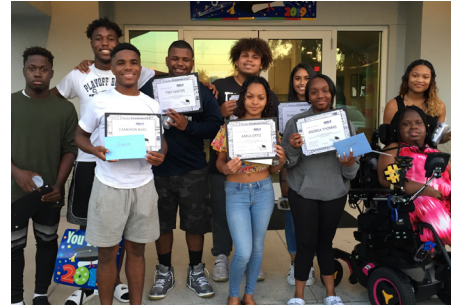
Celebrating grads at the DOCK