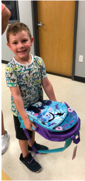
Unity Church of Melbourne set DOCK kids up for academic success with backpacks and school supplies.

Frederik S Upton Foundation Walmart Wells Fargo Foundation