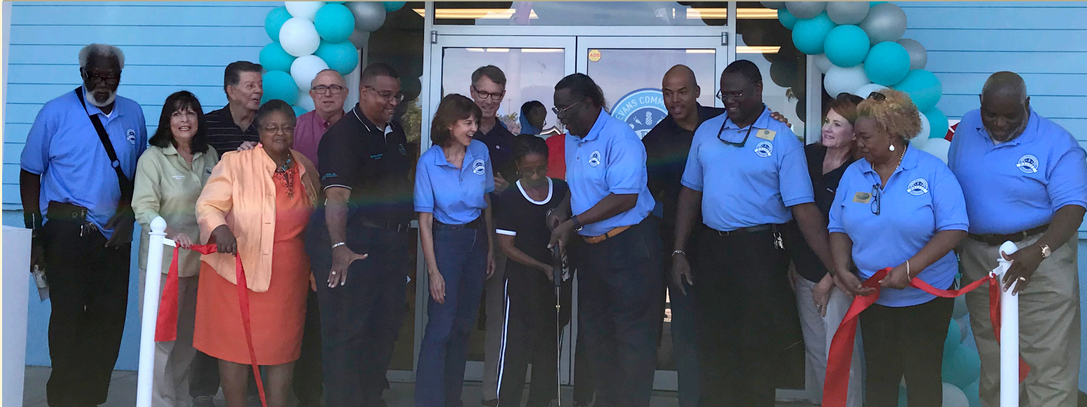
Leaders from the neighborhood, city, local businesses, and churches celebrated the Evans Center opening in March!

“Your ancient ruins shall be rebuilt; you shall raise up the foundations of many generations; you shall be called the repairer of the breach, the restorer of streets to live in.” (Isaiah 58:12)