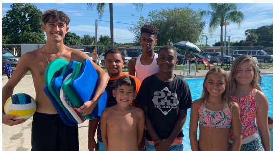
DOCK summer campers learned to swim this summer, thanks to funding from the Margaret Heins Foundation and the cooperation from our friends at the City of Melbourne Recreation Department