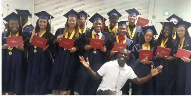
The DOCK graduated 15 seniors this year from Eau Gallie High School, Holy Trinity Episcopal Academy and No Limits Academy!

year's schedule included swim lessons, college campus tours (of FIU and University of Miami) for teens, and trips to Kennedy Space Center and the Orlando Science Center courtesy of L3Harris Corporation; Vacation Bible School brought to the DOCK by Ascension Catholic Church; healthy cooking classes funded through Space Coast Health Foundation; fun and helpful budgeting classes from our friends at PNC Bank, and many other enriching activities. Parents pay a nominal fee for their children to be cared for and nurtured at the DOCK, and this is largely due to your support.