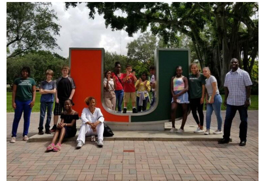
Teens visited college campuses this summer, thanks to funding from L3Harris