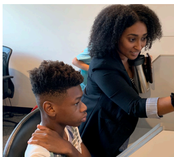
Our friends from L3Harris spent the day with DOCK campers and brought their imaginations to life on a 3D printer!