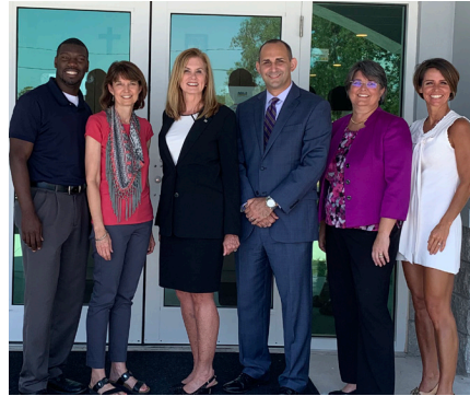
We're grateful for the ongoing support of our partners at Bank of America!