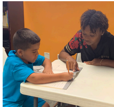
Thanks to Community Foundation for Brevard, we were able to compensate our Teen Leaders this summer.